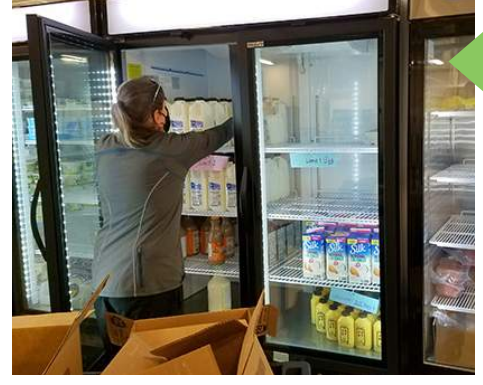
A Food Bank volunteer stocks fresh dairy products for clients provided thanks to grant funding from the Iowa Department of Natural Resources

volunteer, simply visit builtbycommunity.org/volunteer.