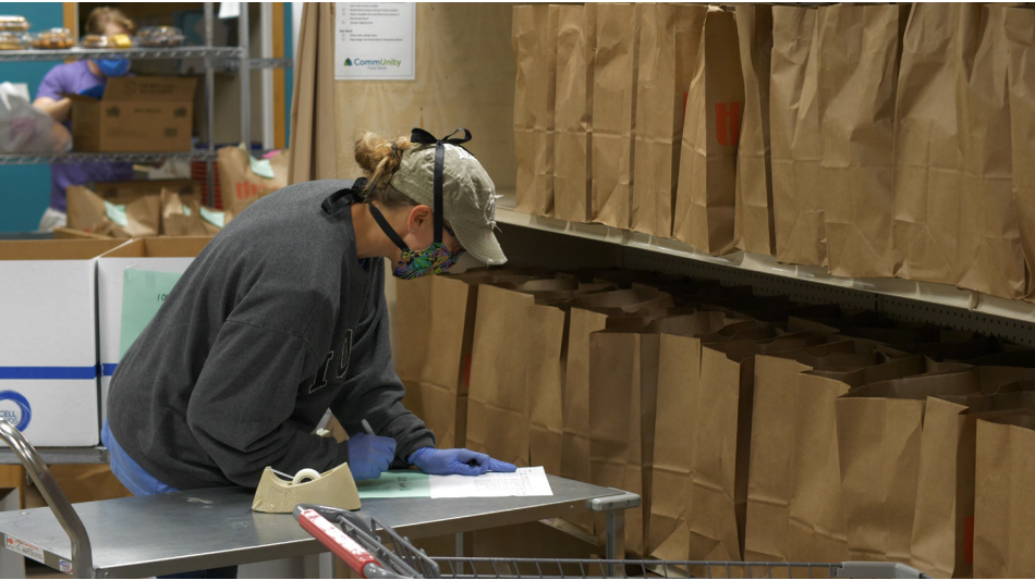
Still from a video segment of the Hunger Banquet program. A volunteer prepares pre-packed bags for distribution.